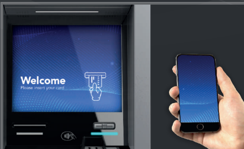
+ FULL SCREEN