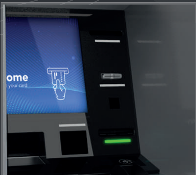
+ CUSTOMIZABLE MULTICOLOR LED