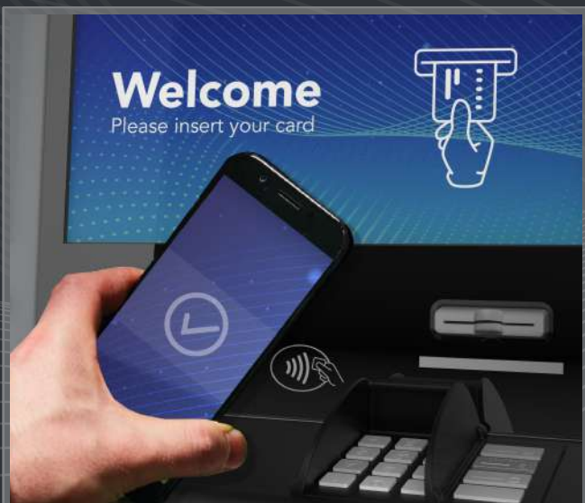
+ CONTACTLESS TECHNOLOGY INTEGRATED